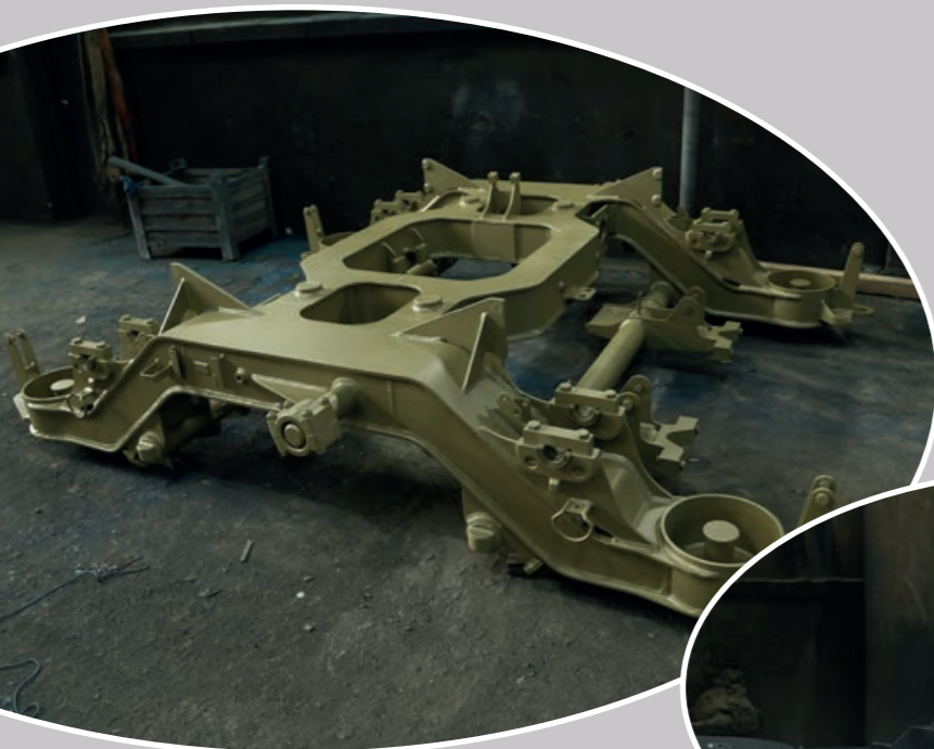
Dutch Railways and Braspenning Indoor longstanding partners

Braspenning Group is an international group of companies offering surface treatment as well as (rope) access and scaffolding solutions in various markets.